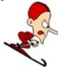
Family Ski and Snowboard Day

switched classes. Overall the day were very productive, and we all learned how to plan a den meeting, and how to play some new games. At the end of the day, we were given our "Trained" patches that we can place on our uniforms if we're actually serving as a Den Chief.