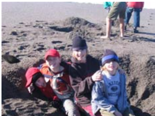
Wrights Beach By Corey Reynolds

People called the number on the flier to schedule a tree pickup. On December 20 and January 6 & 7, we collected trees and brought them to Sequoia Elementary School, where they were loaded into a large garbage truck operated by BFI. The trees were taken to the Elder Creek Recycling & Transfer Station where they were ground up into mulch and compost. We collected over 500 trees and earned over $3000 (suggested donation of $5.00 per tree). These funds were applied to Scout accounts based on the number of hours they worked.