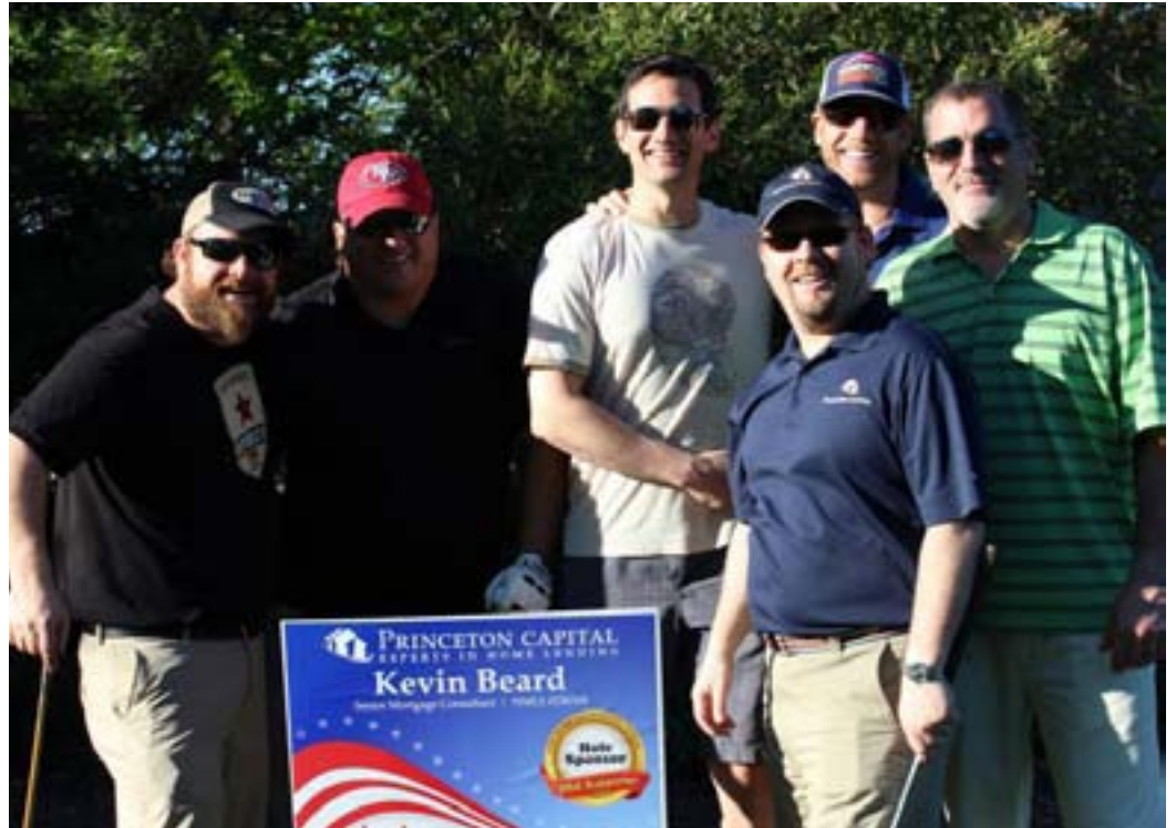
Troop 380 Eagle Scouts #10, 14, 15 and 21 came out to support the troop Golf Tournament