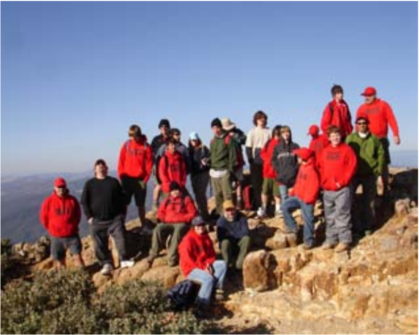
A recent trip to the top of Mt. St. Helena.

High adventure camping is also a part of Troop 380's program. Parents will be notified in advance for these types of programs since the cost is usually higher than regular summer camp. Troop fund raising projects will be used to help offset the cost to the parents.