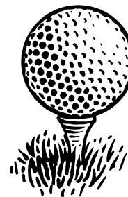
Troop Golf Night – Thursday, August 17, 2006 Bradshaw Ranch Golf Course